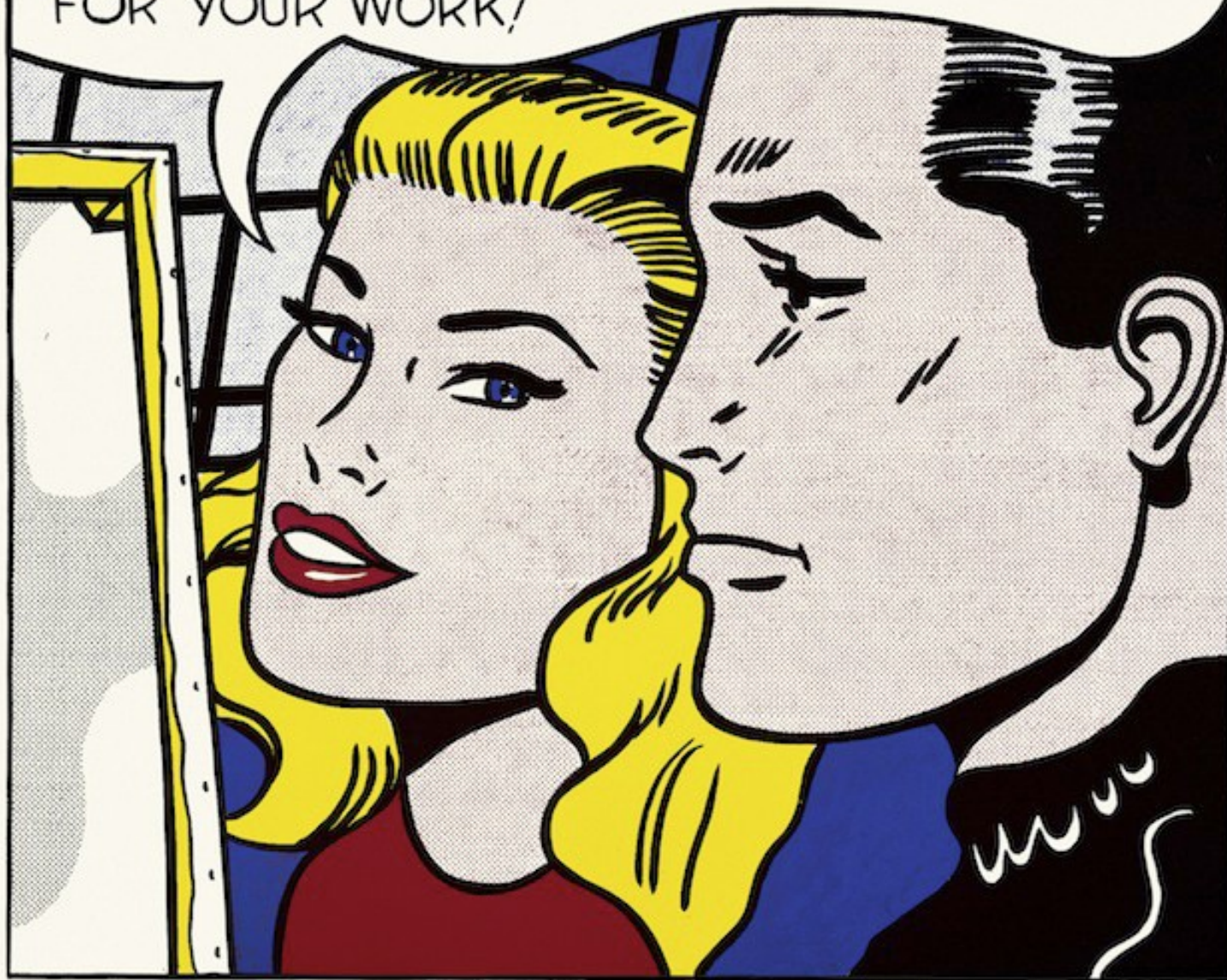
Roy Lichtenstein, Masterpiece 1962 Private Collection © Estate of Roy Lichtenstein/DACS 2012

WHY, BRAD DARLING, THIS PAINTING IS A MASTERPIECE! MY, SOON YOU'LL HAVE ALL OF NEW YORK CLAMORING FOR YOUR WORK!